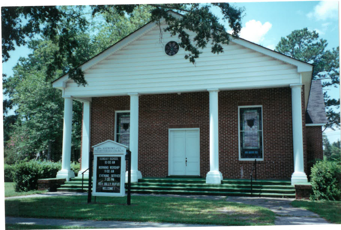
Andrews Presbyterian Church Andrews, S.C.