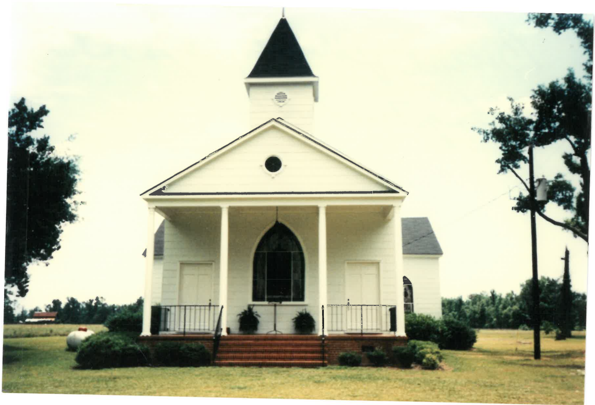
Bethel Presbyterian Church Kingstree, S.C.